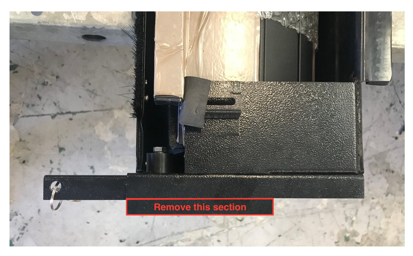
Step 2. Install the included revised brackets as shown below. Remove the foremost T40 Torx screw from the plastic bracket and use it to affix the bracket. Use the supplied hex-headed screw in the rearwards hole to attach the bracket to the vehicle with a 13mm socket. Continue with installation as per the usual instructions.