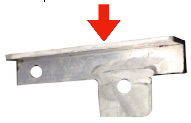
Use this style of bracket (Supplied)