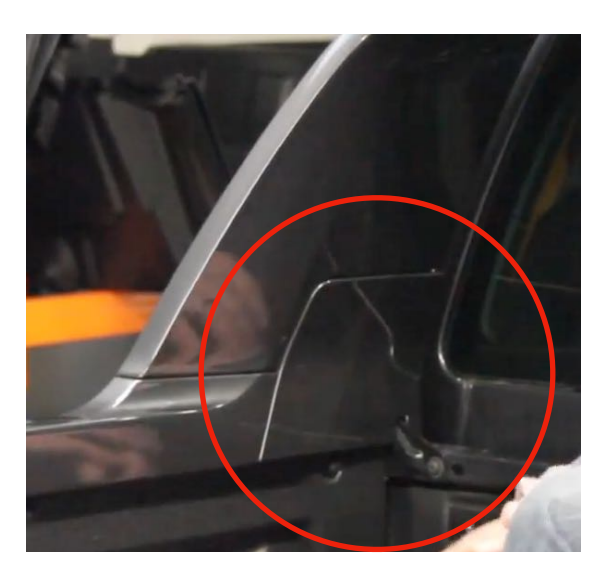
Fig1. Pre 2018 Model. Has access panels in the front corners.

Before installing your Wildtrak Armadillo Cover, you will need to identify which type of Sports bar is installed on your vehicle.