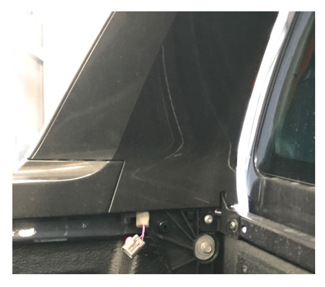
Fig2. 2018 Model onwards. Has no access panels in the front corners.